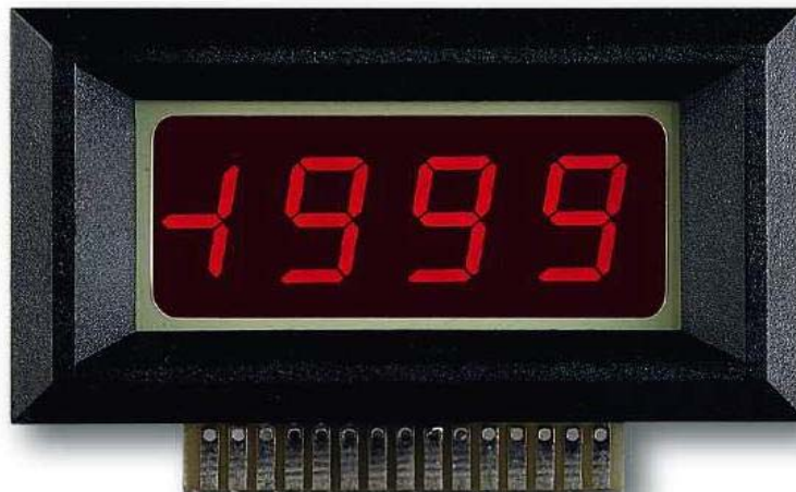
LED display with mounting bezel, Model : DP-40