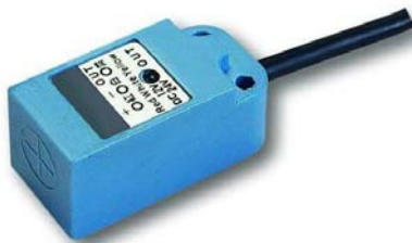
PX-01 Proximity sensor