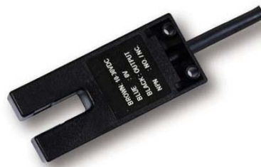
PI-06 Proximity sensor